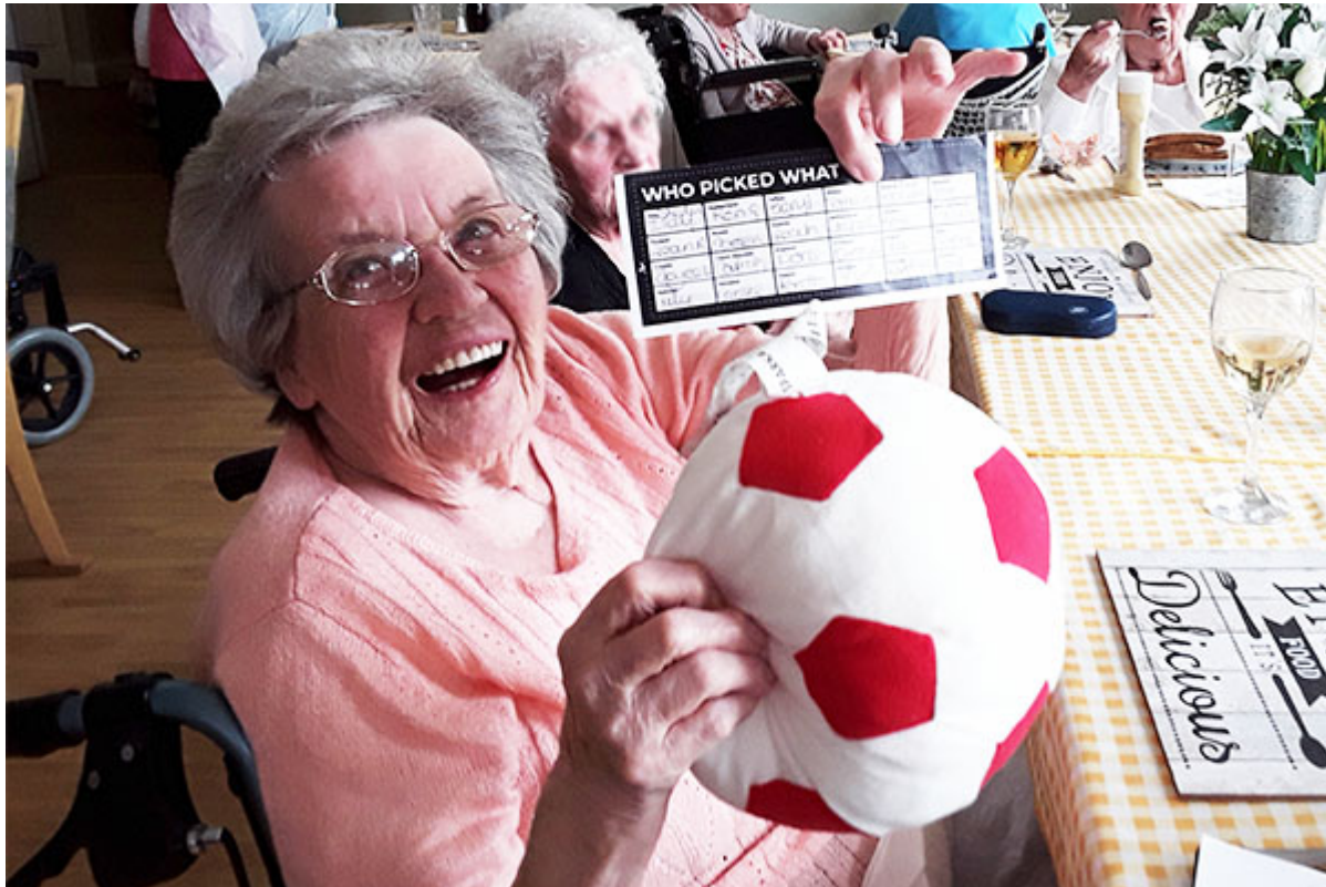
Our happy sweepstake winner!