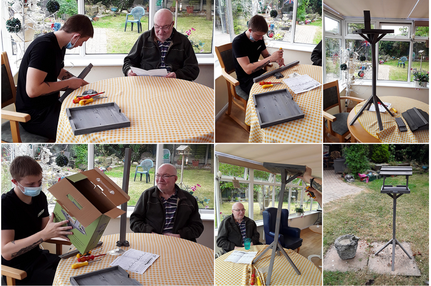
The finished table looks very smart in our garden and we're sure it'll attract lots of feathered visitors!