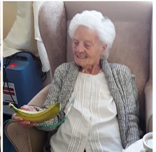
Playing "What's in the bag?"