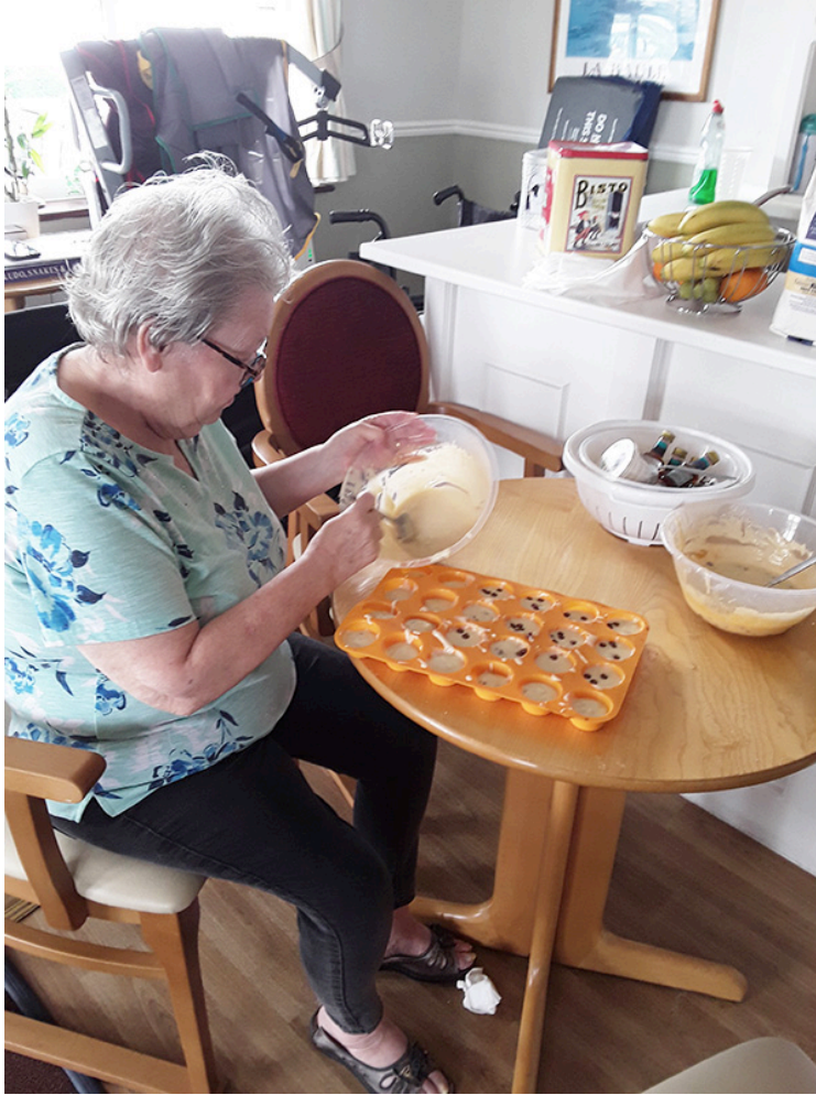
Chocolate drop cupcakes