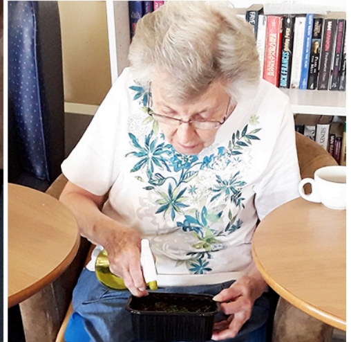
Taking care of our cress plants