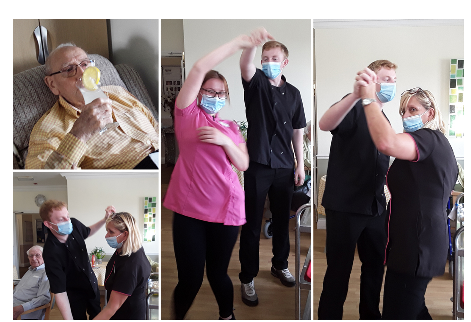
Our staff having a dance!

And our staff like to join in with the action when it comes to music and movement! Look at our team members , happily dancing away to entertain our residents, who were all laughing and clapping at our lunchtime dance off !