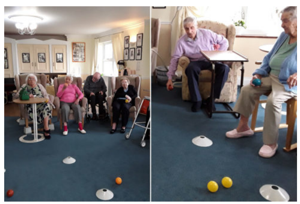
Testing our skills at carpet bowls