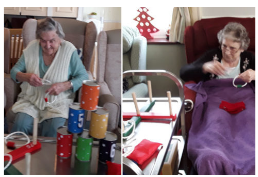
Ready, set, aim!